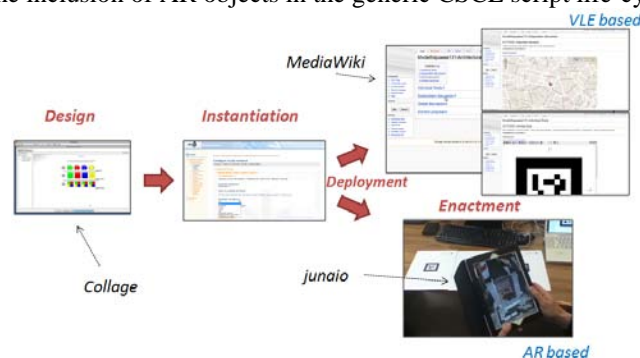
Figure 3. Implementation of the ARchitectural Styles scenario

Figure 3 illustrates the implementation of the ARchitectural Styles scenario by means of a prototype, developed as a proof of concept of the inclusion of AR objects in the generic CSCL script life-cycle.